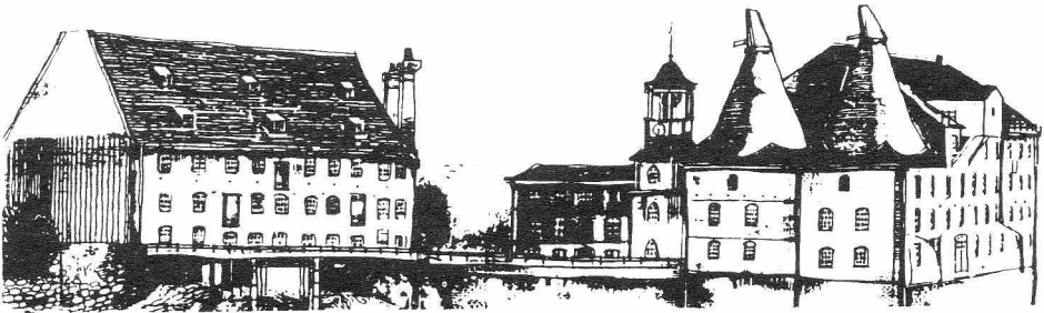
The House Mill (left) and Clock Mill at Three Mills. The latter has been converted into offices

A derelict tidal mill bridges the mud of Bow Creek in East London. It has been idle for fifty years and it leaks. Large portions of the timber framework are damaged by rot and its ironwork by rust. No machinery works, and much of what was there has disappeared. Restoration costs could total several million pounds, yet the House Mill at Three Mills is being restored by an independent trust aided by the European Commission, Government City Action Team, Newham Council, English Heritage, Lea Valley Park, Bass plc, Tesco plc, East London River Initiative, the Prince of Wales' Business in the Community Group and most recently the Inland Waterways Association. The Mill was a key project in a successful 1992 City Challenge bid for grants of £37.5m over five years.